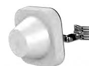
19cm size w/ 60GHz + 5GHz