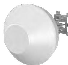
35cm size w/ 60GHz + 5GHz