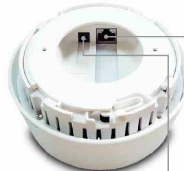
DC-inlet for Power Ethernet Port for RJ-45 cable