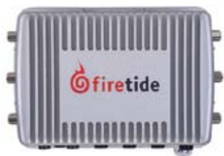
HotPort 7000 Outdoor Mesh Node