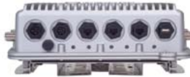
HotPort 7000 Outdoor Connectors