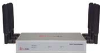
HotPort 7000 Indoor Mesh Node

HotPort® 7000 mesh nodes ship as 802.11a/b/g/n dual-radio capable hardware, with enhanced functionality enabled through software licenses. Projects that do not require 802.11n MIMO (multiple input, multiple output) capacity or dual-radio capability can start with 802.11a/b/g-enabled single-radio configuration. Dual-radio functionality can easily be enabled through a software license at an additional cost. Similarly, a separate software license can enable MIMO functionality for operation in 40 MHz channels, and to take advantage of 802.11n technology to achieve throughput of up to 300 Mbps outdoors and 400 Mbps indoors.