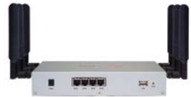
HotPort 7000 Indoor Connectors